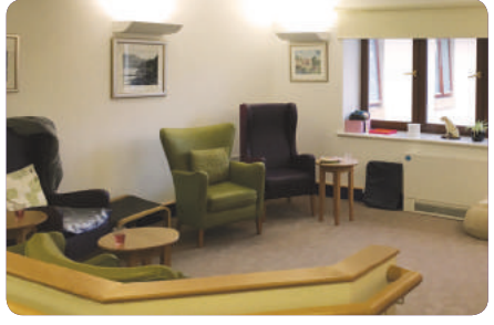
Resident seating area in Edinburgh

At Erskine Edinburgh Home this year we have focussed on improving and developing our environment. Our first major project, which was completed at the beginning of the year, was to enhance the dining experience for residents in Sassoon House. We asked residents what they would like and they responded that they would like to feel as if they are eating out in the garden come rain