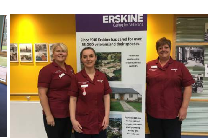
From Left: Artists in Residence Age Simulation Training The new dining room in Sassoon House, Edinburgh Specialist Nurses

Overall a busy and exciting year for us all.