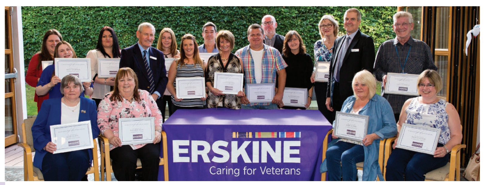
Erskine Glasgow Long Service Awards