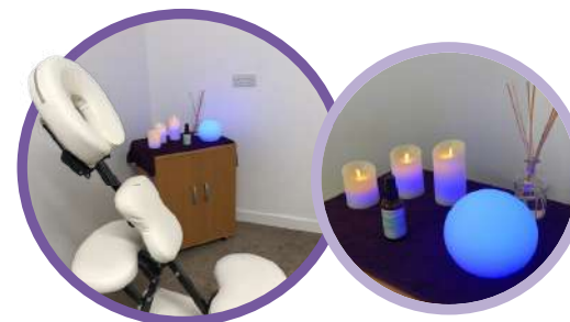
Pictured: The "Zen Den" space for staff to visit

Our therapists deliver massage sessions tailored to the individual needs of each colleague. This project will continue to have a positive impact upon the wellbeing and health of our care home staff who work extremely hard to ensure Erskine's Veterans can enjoy the best possible quality of life.