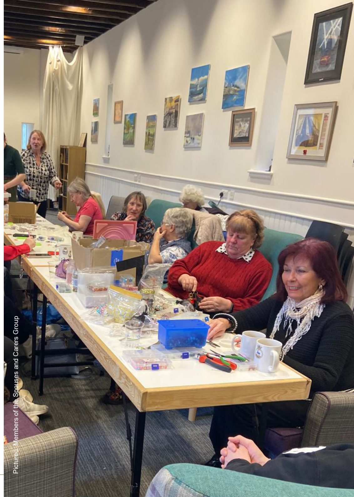
Pictured: Members of the Spouses and Carers Group

87p is spent on services to support the Veteran community with 13p going towards raising the next £1.