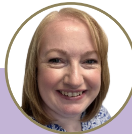
Legacy Development Manager

There are many different roles within Erskine and each one is taken on by an amazing individual offering their skills and knowledge to help continue to make Erskine's care of the highest standard.