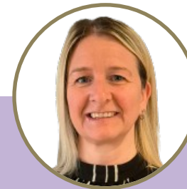
Accommodation Services Manager

I make sure that the generous people who have remembered Erskine in their Will have their wishes carried out, something I take very seriously. I speak to solicitors to ensure that gifts are handled properly, and we use them to their maximum benefit.