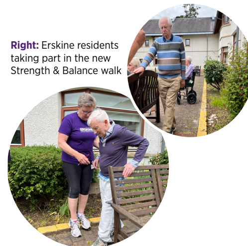
Right: Erskine residents taking part in the new Strength & Balance walk

"People come here at the end of their lives, they don't know how long they have, I want them to enjoy it as much as possible."