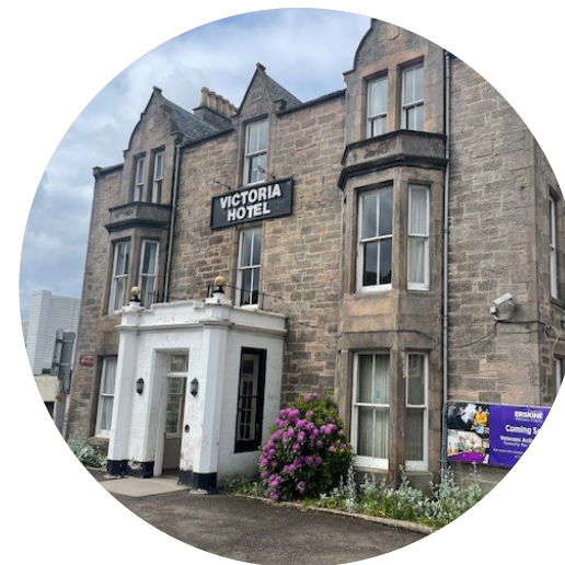
Above: Victoria Hotel, Forres

EVAC North will be modelled on the Erskine Reid Macewen Activity Centre (ERMAC) based in Bishopton. ERMAC opened six years ago and boasts over 200 members. It allows Veterans to enhance their own wellbeing and an opportunity to engage with people who have shared similar experiences in the Armed Forces as well as learn new skills, hobbies and interests.