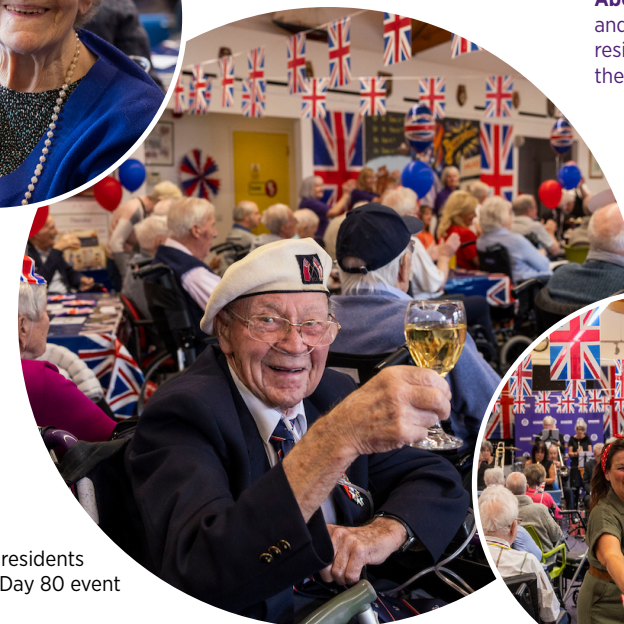
Above: Erskine residents enjoying the D-Day 80 event