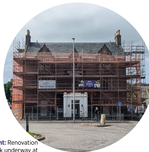
Right: Renovation work underway at Victoria Hotel