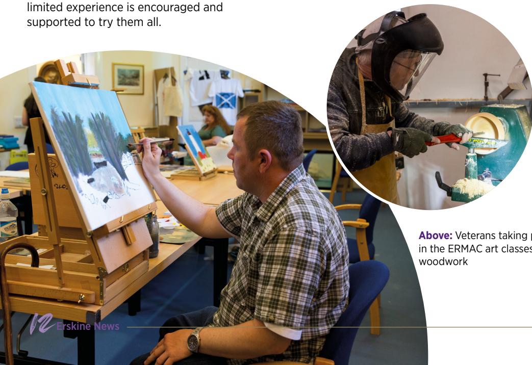
Above: Veterans taking part in the ERMAC art classes and woodwork

Recently our ERMAC members have been designing their own Christmas cards ahead of the festive season. Three designs are available for you to purchase your very own Veteran designed Christmas cards this year. Read on to meet the Veterans who designed the cards.