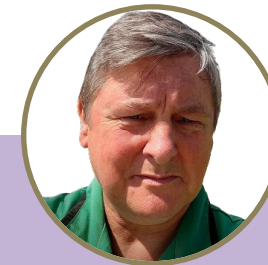
Erskine Edinburgh Home Activities Assistant

I'll have been working with Erskine for 20 years.. In my current role I manage the non-care accommodation on the Erskine Veterans Village, including 44 cottages, 5 assisted living apartments and 23 transitional supported apartments. This largely involves giving support and providing a listening ear for the Veterans and families staying in the Erskine Veterans Village. I really enjoy my role and I'm proud to work for Erskine.