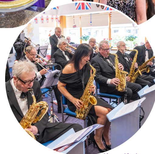
Above: 16-piece swing band and singer entertained residents with music from the 40's era