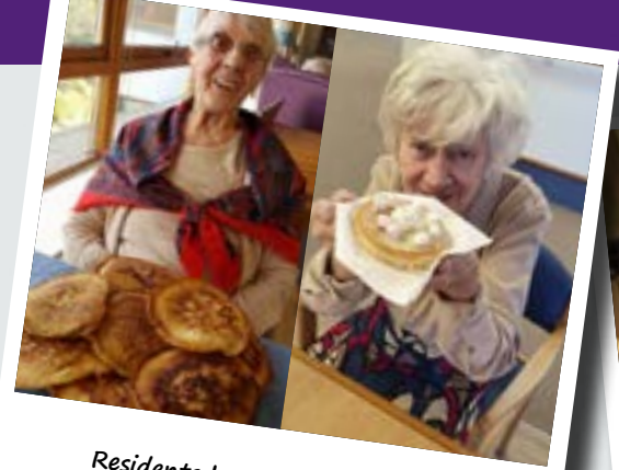
Residents had a flipping good Pancake Tuesday!

Here's a few snippets from Autumn 2020 to now: