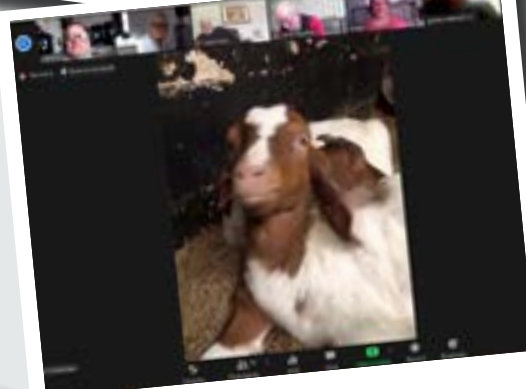
A goat called Ozy from Cronkshaw Fold Farm in Lancashire joined an ERMAC Zoom call