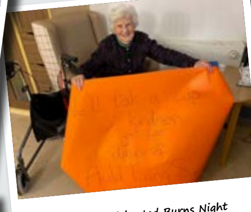
Veterans celebrated Burns Night with some poetry

Some of our residents found it difficult